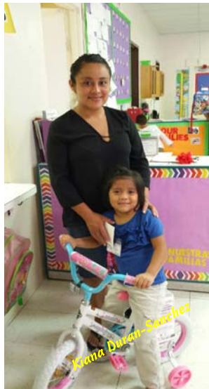
Beacon Bay HS