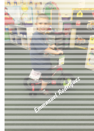
Santa Rosa HS