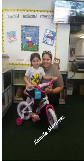
La Feria HS