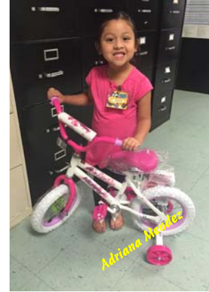
Los Indios HS