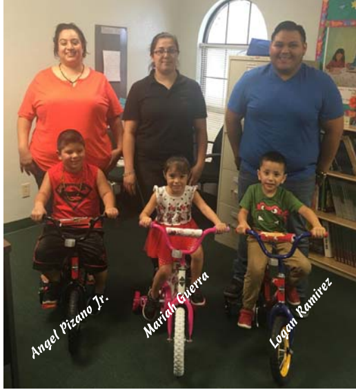
Harlingen HS Zavala HS TSTC HS

To boost the attendance during the summer, NINOS Inc., held a drawing among the children that had perfect attendance during the summer program from June 8, through August 12, 2016. We are proud to announce the winners of brand new bicycles.