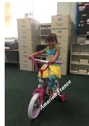
Rio Hondo HS